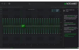
Line chart example in android github. Android custom line chart example. Multi line charts android example. Mp android line chart example. Android studio line chart example. Android dynamic line chart example. Mpchart android line chart example. Line chart cubic lines android example.